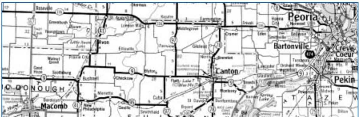
The area between Macomb and Peoria needs a four lane road for economic progress