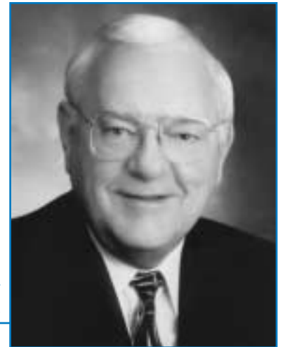
Illinois Governor George H. Ryan

It is very important to have a packed house for this event. A large turn out for all of the 336 Coalition events is the most important thing everyone can do to further our efforts in building the highway. We hope to have over 200 at the luncheon.