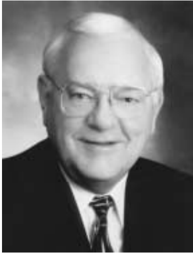
Illinois Governor George H. Ryan

Governor George H. Ryan will be the featured speaker at a 336 Coalition luncheon Thursday, June 14 at noon at the Canton Country Club. This will be one of the first major events held at the new clubhouse.